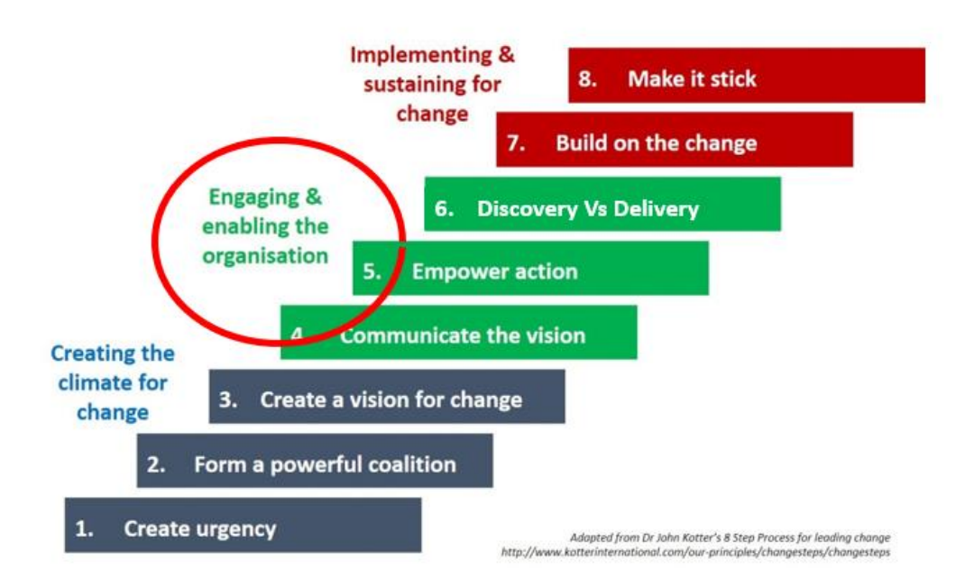
Figure 1 Kotter's 8 step process for leading change.

We believe that in terms of Kotter's model, we have created the climate for change and are currently at the stage of engaging and enabling the organisations, and we are having early success in implementing system change in the membership and governance of local Health and Wellbeing Boards, an Essex County Council motion on physical activity, and the adoption of the LDP by the Essex Assembly and Essex Partners.